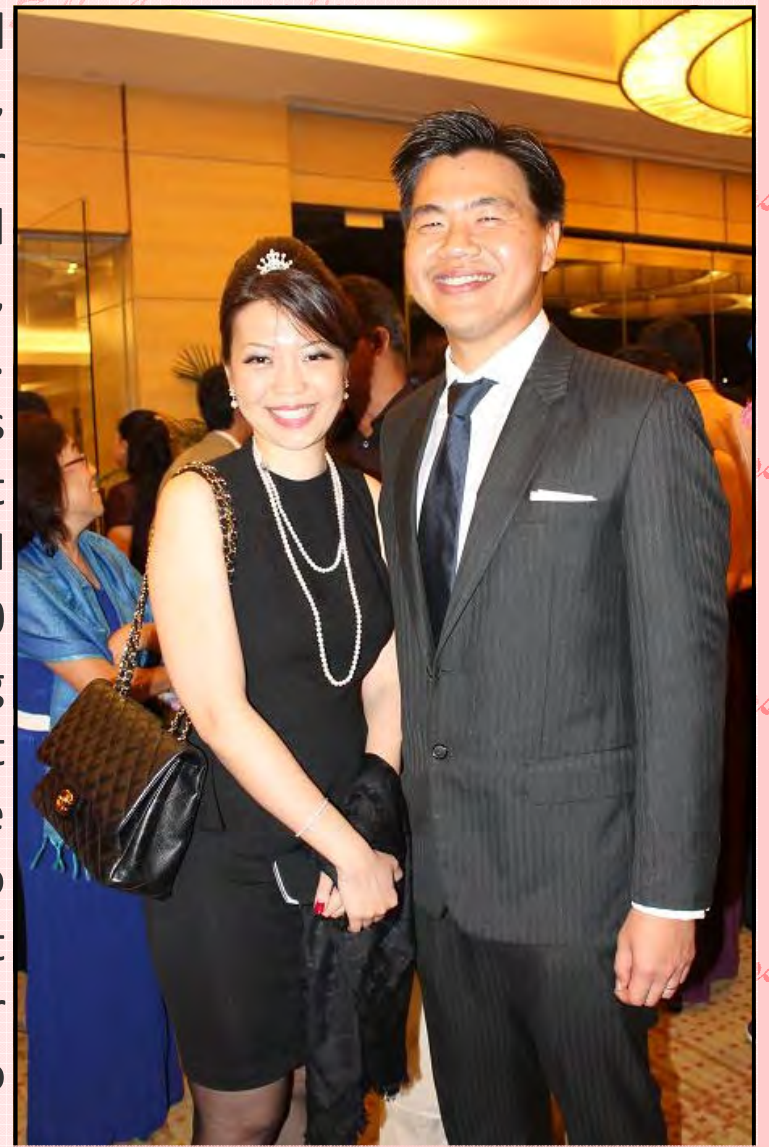
AUDREY HEPBURN AND GEORGE PEPPARD FROM BREAKFAST AT TIFFANY'S

I hope everyone had a fun and glamorous Hollywood Annual Dinner this year! I am pleased to see so many of our staff, clients and associates dressing up and having a good time for our yearly get-together. We even had some international and galactic stars such as Michael Jackson, Wolverine, Darth Vader, Queen Amidala, some Mexican fella, etc attending this event. My wife and I had a great time to meet and have a few drinks with everyone. As the company grows bigger, this event becomes more important as a yearly opportunity to meet and get to know the people in the group. We currently have 700 employees split over 20 projects all over the country, making it difficult to meet and the Annual Dinner is one of the best events to get all of us together, although there is always some site staff that will have to sacrifice attending the event due to work or distance. I thank all these staff for their commitment and dedication. I would also like to thank the Annual Dinner organizing committee for a job well done and look forward to next year's event.