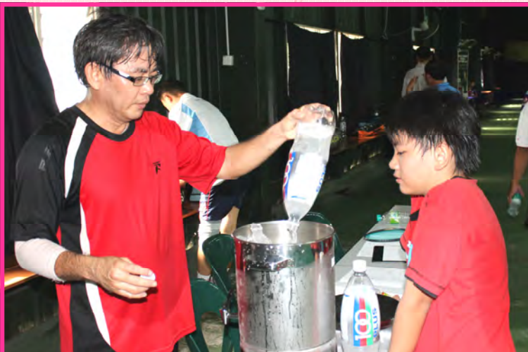
THE WATER BOY