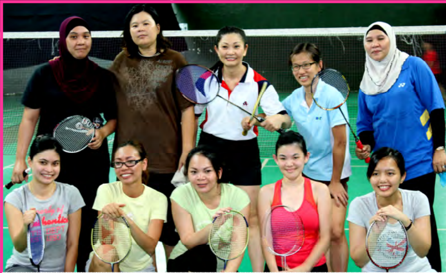
ALL THE PRETTY SPORTY LADIES