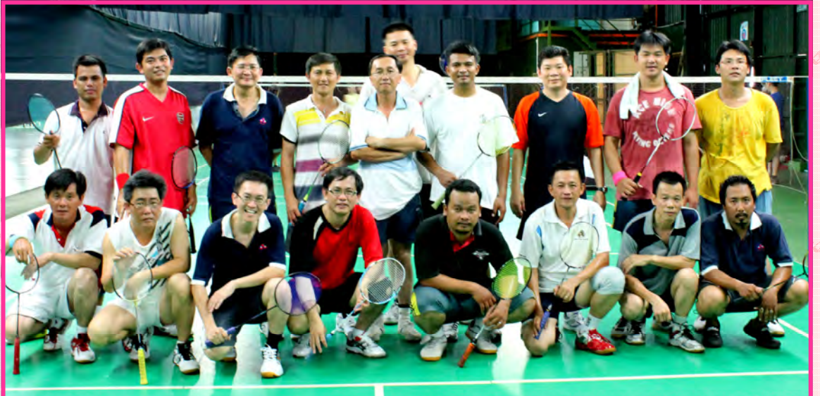
ALL THE HANDSOME SWEATY GUYS