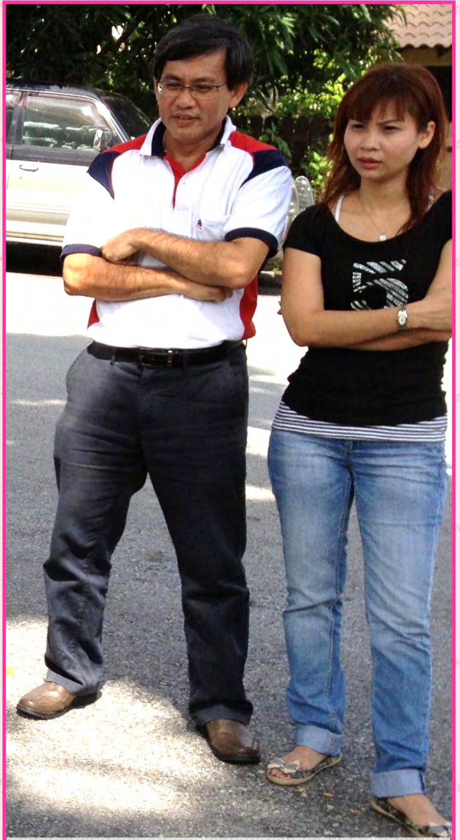
THE CURIOUS ONE