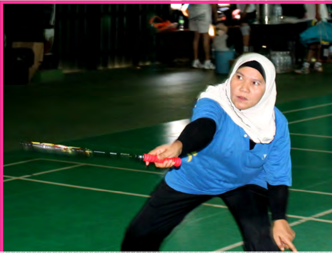
THE CHAMPIONS. GOT STYLE EH?