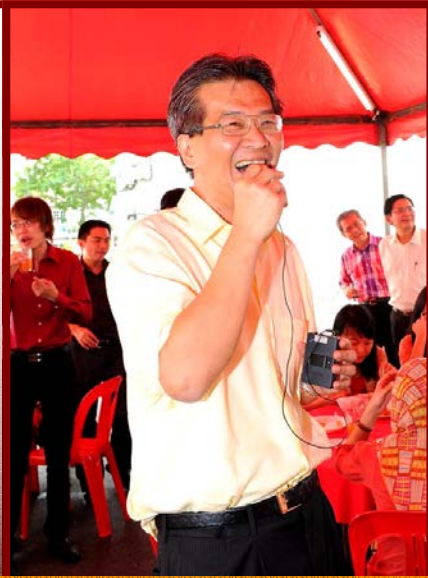
AND WE SHALL LAUGH!