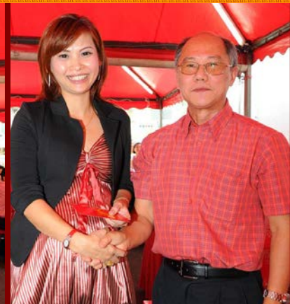
LUCKY MOMMY NO.2