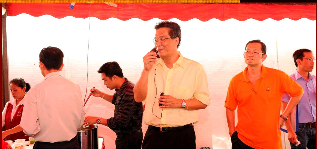
GUESS WHAT EACH OF THE PERSON IN THIS PICTURE HAVE IN THEIR MIND