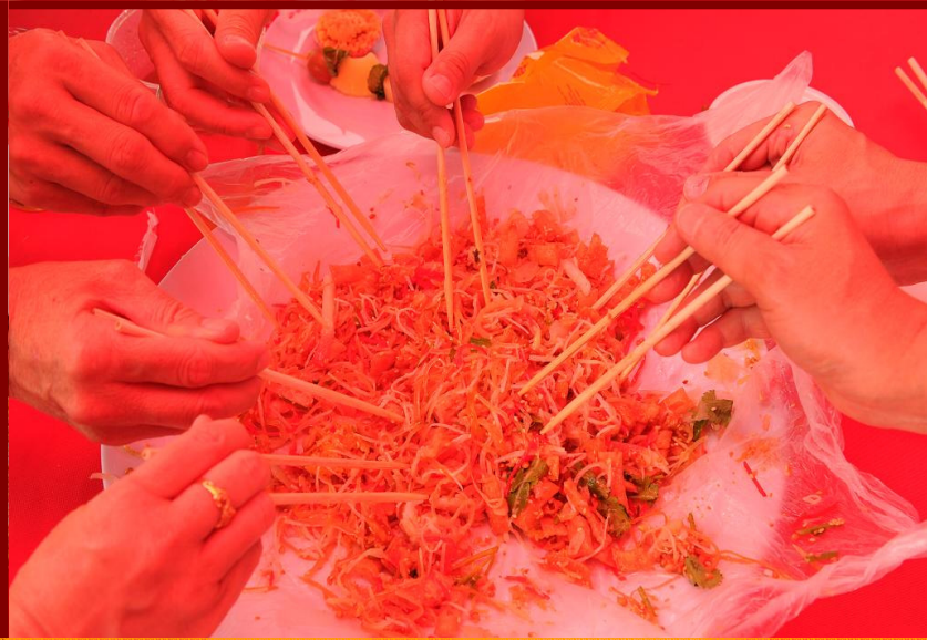
OUR OWN YEE SANG