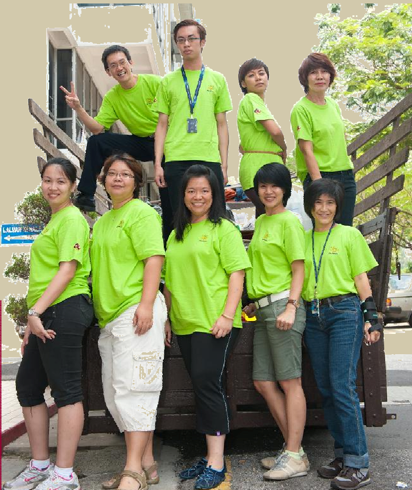
2011 SRC COMMITTEES