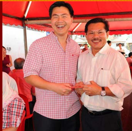
GIVE ME THAT!