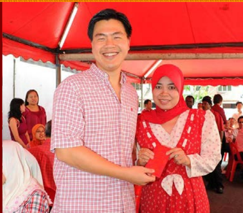
LUCKY MOMMY NO.1