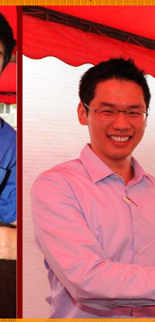
FINALLY, ONE FOR ME!