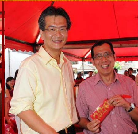
THE "LUCKIEST" ANG POW