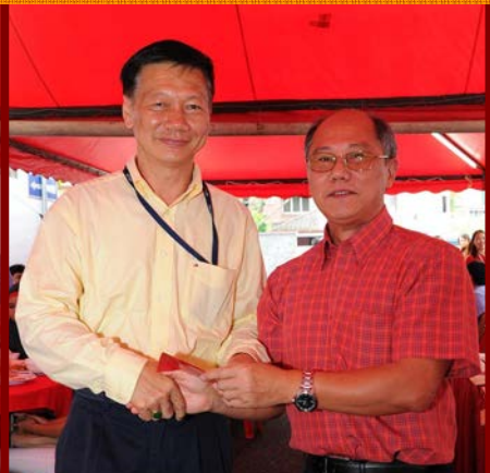
FINALLY I AM LUCKY!