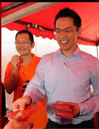
ONE FOR YOU, ONE FOR YOU, ONE FOR YOU... (YAWN...)