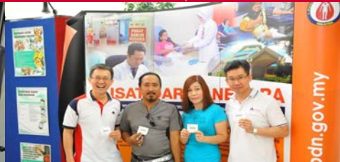
Supporters from HQ