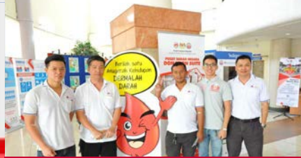
Engan Site Supporters