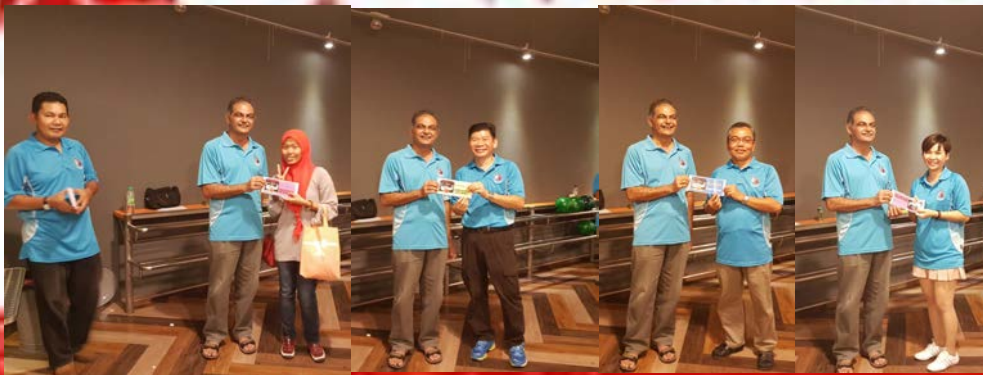
Friendly match between PPAMPS, Loh & Loh and WET. Sponsored by Custody, Care Operation and Maintenance Contract for Pahang-Selangor Raw Water Transfer Project. Dated 28 th May 2016 venue at Cyberjaya DPulze shopping centre. Total 28 participant (19 pax from PPAMPS, 6 pax from Loh & Loh, 3 pax from WET).