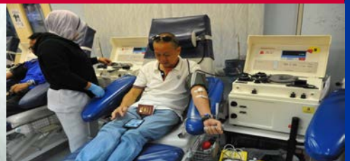
Yeoh TS from SDP